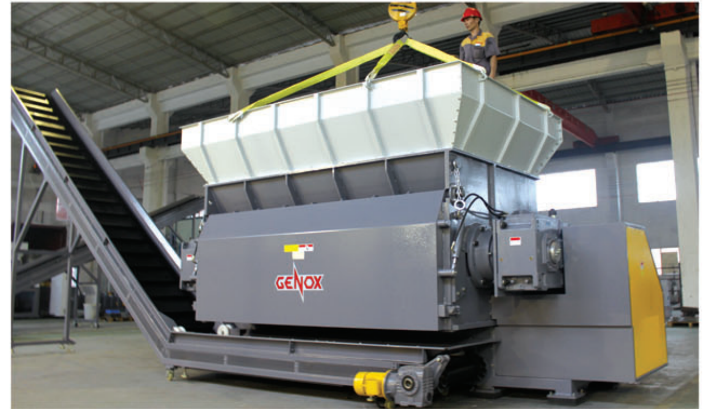
BH2800 Single shaft shredder